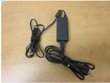
Codec Power Supply